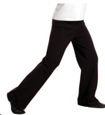
Black Jazz Pants /Black jogger pants