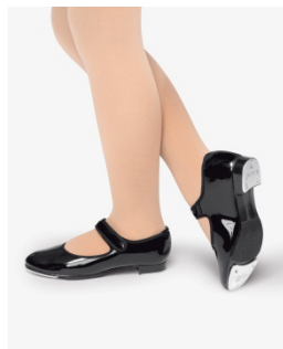
Black tap shoes