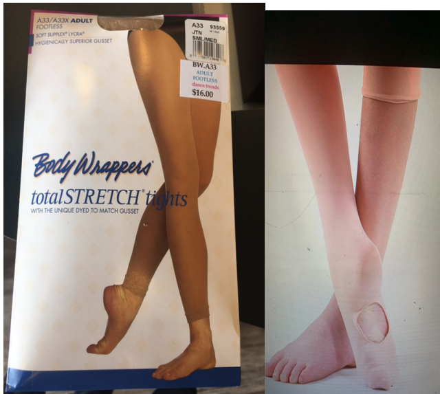
(Tan footless tights or convertible tights) (Pink convertible Tights)